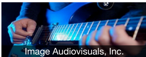
Image Audiovisuals, Inc.

PLEASE NOTE: The prices listed on this solutions guide are rental rates per room, per day, and are subject to current taxes and a $50 Delivery Fee. Cancellation must be received at least 24 hours prior to the start of the meeting to avoid any charges. All "ASAP" orders are subject to a $50 Last Minute Fee.